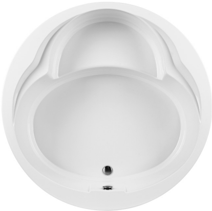
Features an integral seat.